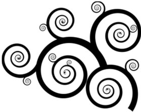
2017 Thanksgiving By Alicia Wong